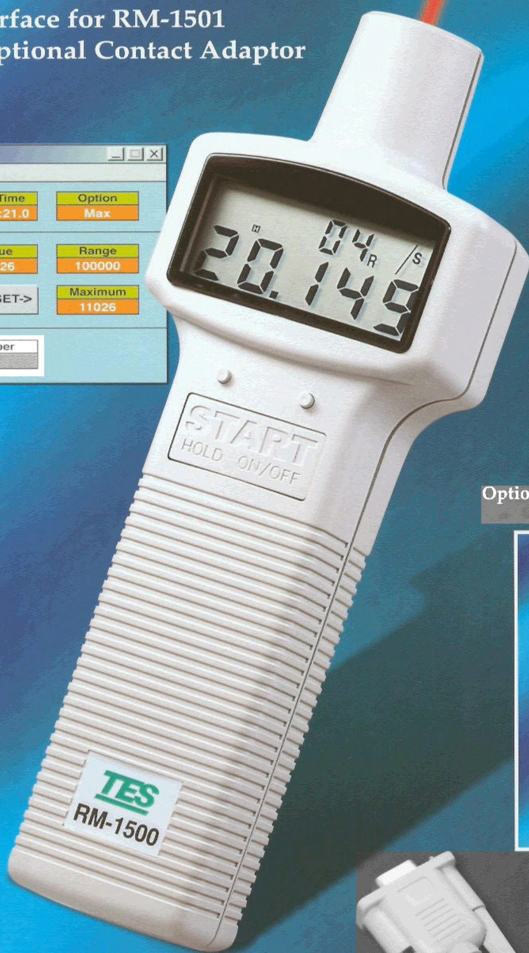
Optional Contact Adaptor RM-1502